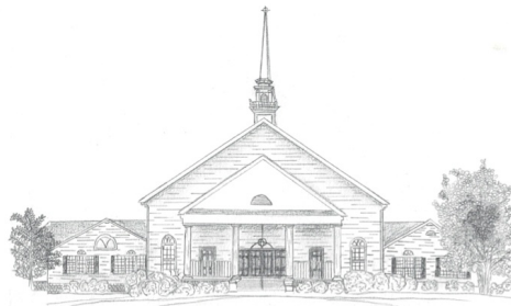
Lloyd Presbyterian Church

The PNC is meeting every Wednesday at 6:15pm in Darden Hall. We start each meeting with prayer and a devotional. We intentionally are doing team building exercises each session. At the end of the meeting, we close with prayers for our church, community, families and each other.