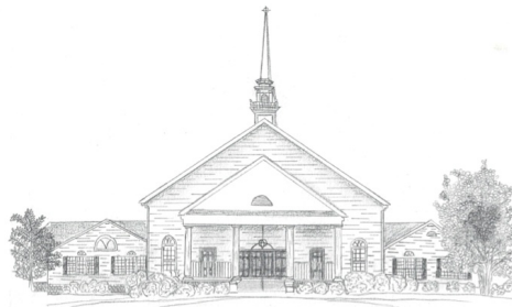
Loyd Presbyterian Church

The PNC is meeting every Wednesday at 6:15pm in Darden Hall. We start each meeting with prayer and a devotional. We intentionally are doing team building exercises each session. At the end of the meeting, we close with prayers for our church, community, families and each other.