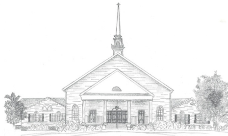
Loyal Presbyterian Church

The PNC is meeting every Wednesday at 6:15pm in Darden Hall. We start each meeting with prayer and a devotional. We intentionally are doing team building exercises each session. At the end of the meeting, we close with prayers for our church, community, families and each other.